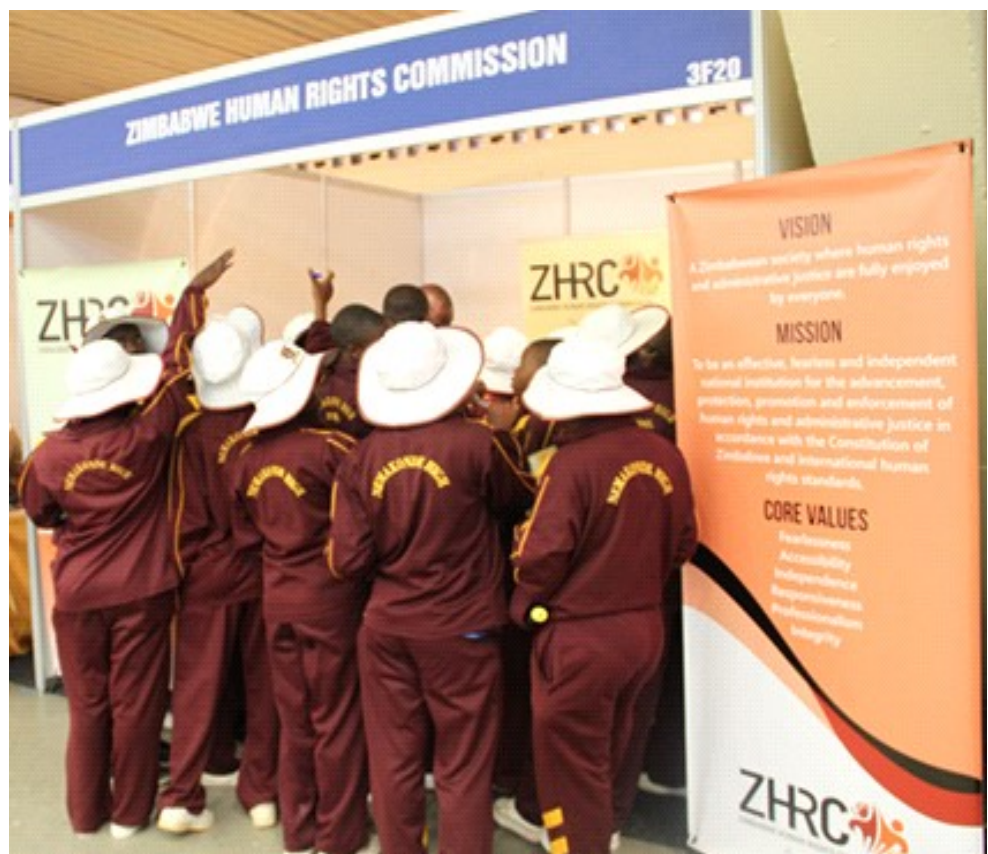
Students from Nemakonde High School won various prizes for successfully answering questions at the ZHRC stand at ZITF in Bulawayo.