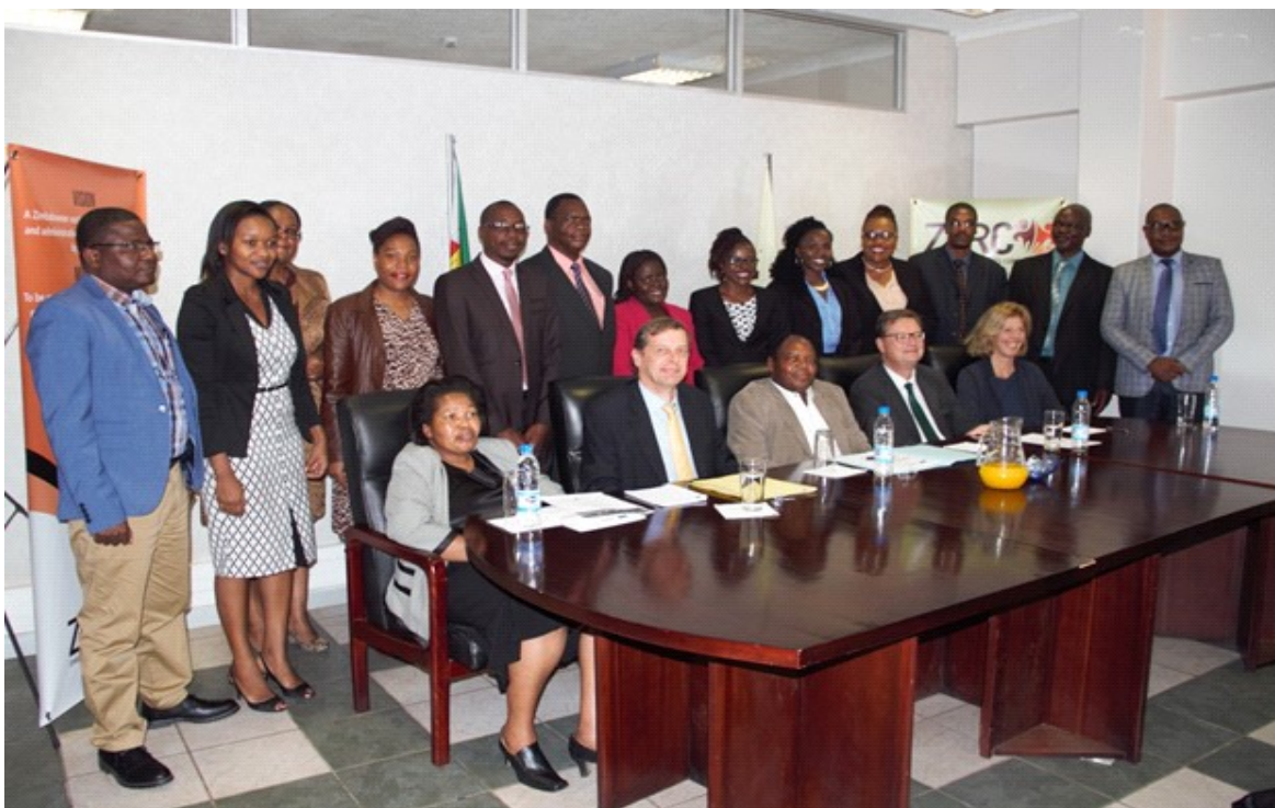
Staff members who attended the ZHRC-EU/GIZ partnership launch had the opportunity to pose for a photograph with the partners.