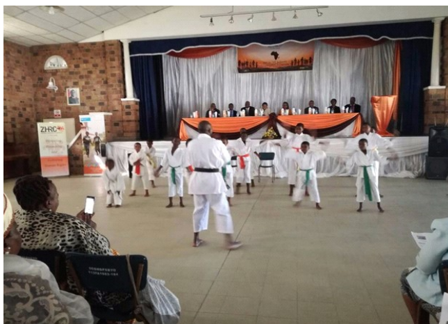
Left...Children from SOS Children's Home in Bulawayo entertain the crowd on the belated Day of the African Child commemorations organised by ZHRC on 15 July 2017.