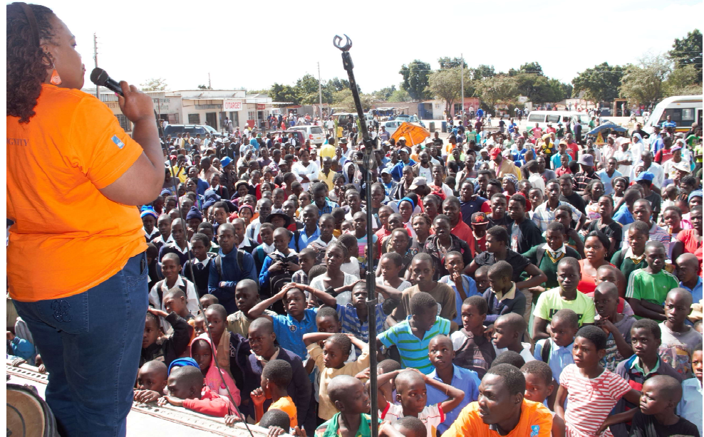
ZHRC received 20 complaints at the Overspill Roadshow in Epworth on 29 June 2017.

Bulawayo this year, for the first time in its history.