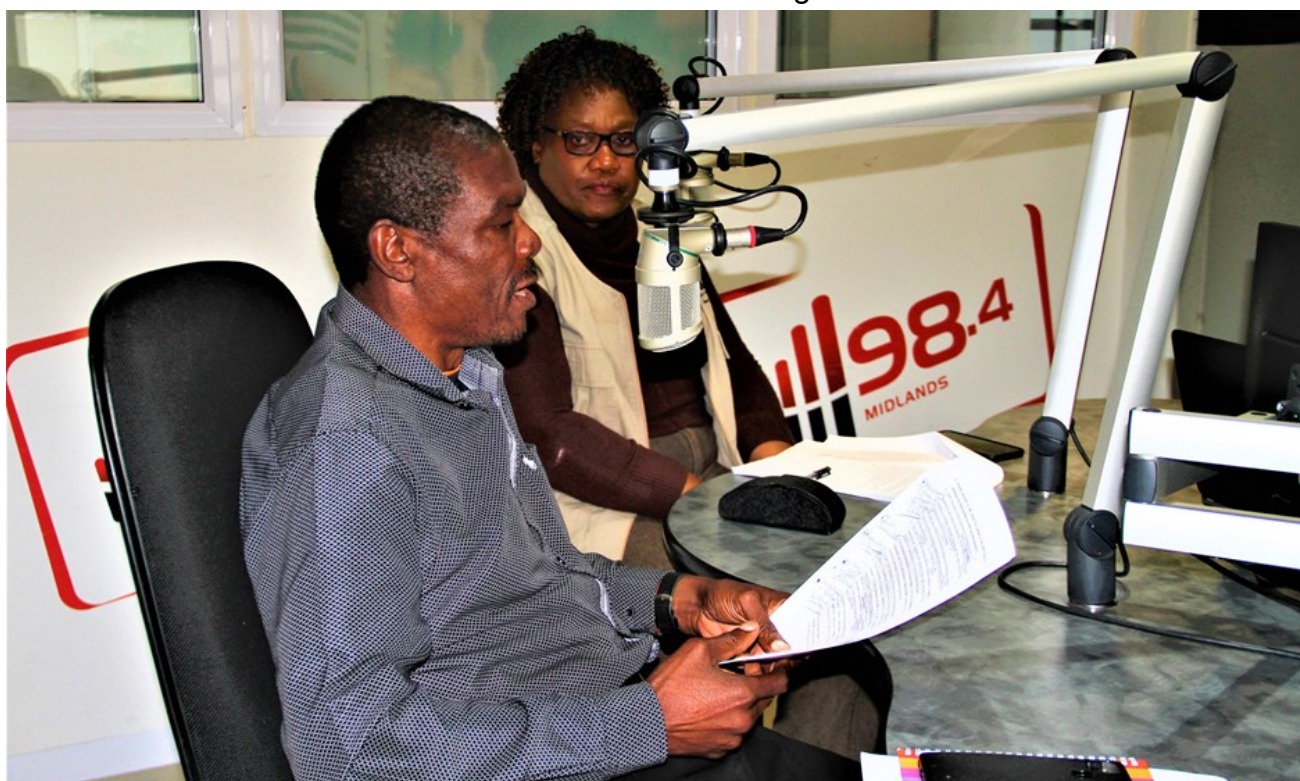
A team from the Commission embarks on a human rights educational campaign using community radios in the Midlands Province.

IEC materials on electoral rights in local communities to raise awareness on electoral rights. In Gwanda, the team took the opportunity to visit various stakeholders to notify them of their presence and intended activities in the district. The visits to stakeholders were also aimed at gathering their views on the general human rights situation in the district especially regarding the need for duty bearers to play their critical roles in the protection of human rights and of electoral rights during the pre-election, election and post-election periods. In Gweru, initially listeners of the three radio stations indicated they were not free and comfortable to make comments or ask questions because of fear of publicly discussing politics but progressively improved as the programmes unfolded. Issues raised by the listeners were similar to those raised during community outreaches, for example, concerns on forced assisted voting, partisan conduct of traditional leaders and partisan distribution of agricultural inputs including seed. Other issues raised included fear of wearing regalia of certain political parties, inability to freely express their political freedoms by attending rallies and meetings of their choice due to fear of victimisation, intimidation, possible abduction and other violations and cases of police failure to reasonably act on reported cases of rights abuses.