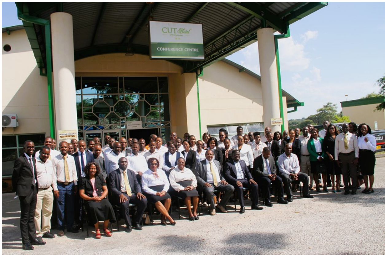
Participants at the recently held Strategic Planning Workshop in Chinhoyi take time for a photo shoot with Commissioners and the facilitator.