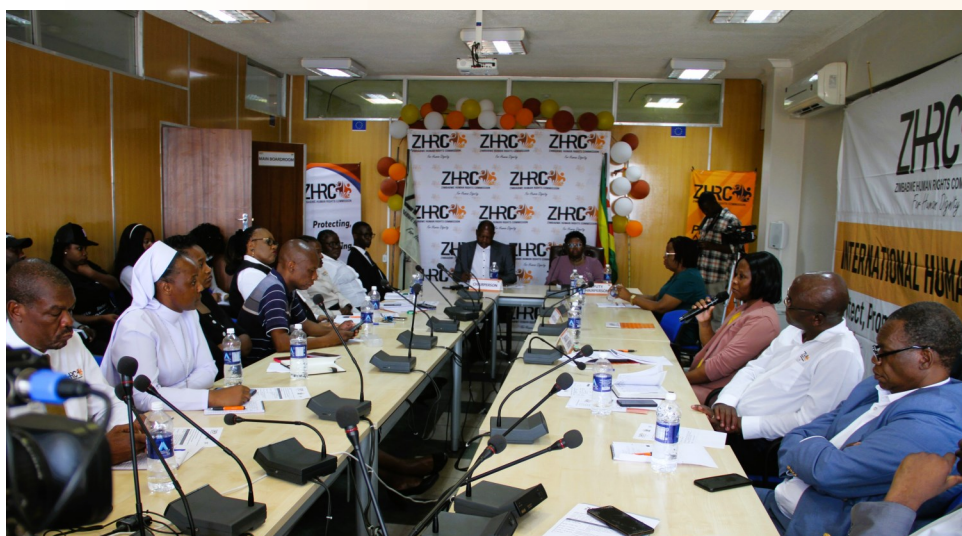
Participants at the 2023 International Human Rights Day Press Conference held in Harare on 8 December 2023.

The Commission, however, believes that despite progress made, much still remains to be done to improve the human rights situation in the country and to ensure that a culture of human rights becomes ingrained in our society.