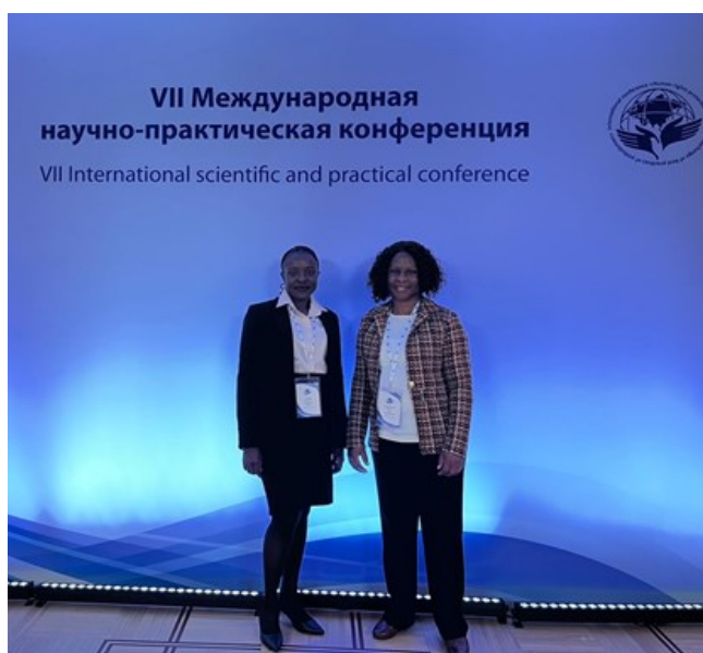
Photographs from the VII International Scientific and Practical Conference "Issues of Human Rights Protection: Exchange of Best Practices of Ombudspersons", which was held on 18 October 2023 in Moscow, Russia.