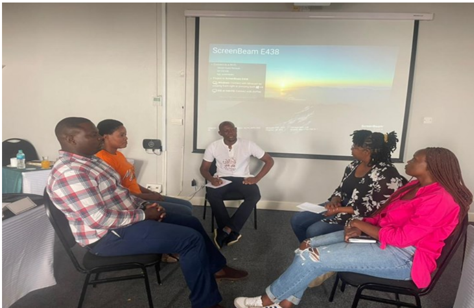
ZHRC Human Rights Officers Role-Playing Mediation Proceedings

was to equip Human Rights officers with the necessary knowledge and skills to handle and solve human rights-based disputes by invoking ADR mechanisms and related principles of fairness and impartiality. The Human Rights Officers were trained on International Best Practices that should be employed when invoking the relevant ADR mechanisms to solve human rights complaints. The success of this training is a testament to the ZHRC's commitment to promoting a culture of human rights protection and respect for human rights in Zimbabwe. The ZHRC's success in conducting the ADR Mechanism training is a significant milestone in the Commission's journey. It demonstrates the ZHRC's commitment to building capacity within its ranks and ensuring that its officers are well-equipped to handle any human rights issues that may arise. This training has undoubtedly enhanced the Commission's ability to effectively handle human rights complaints and investigations through ADR.