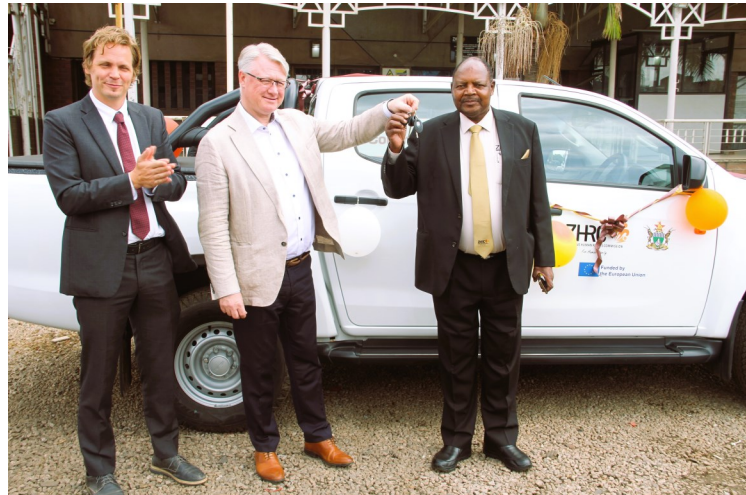
(Above) ZHRC's work received a boost after the Commission got a donation of a motor vehicle and laptops from the European Union through RWI.